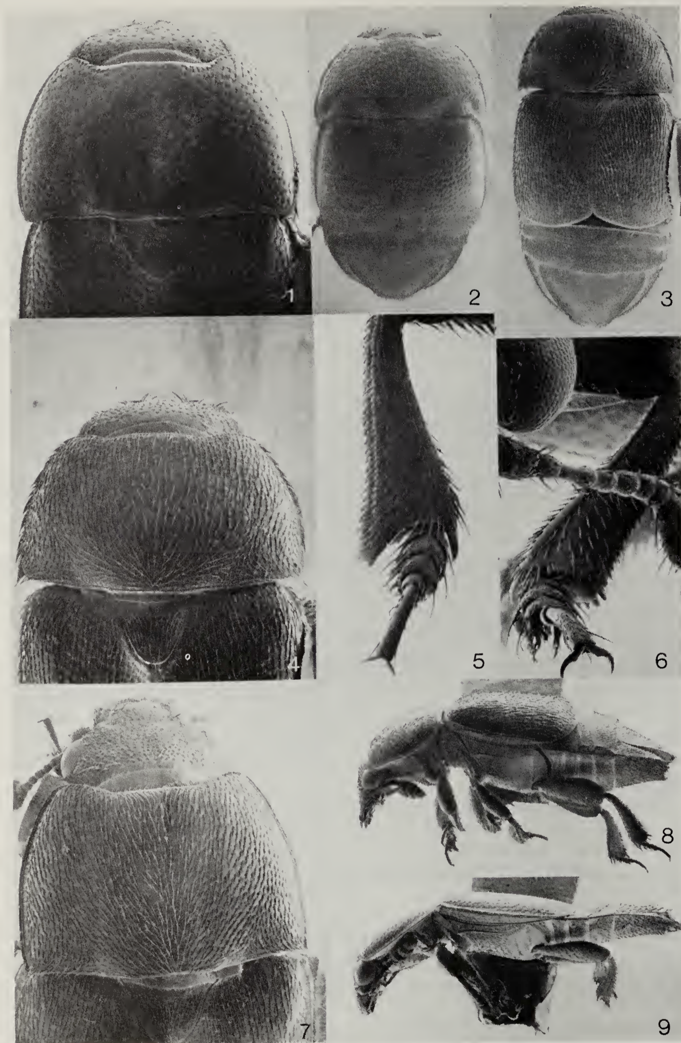
Fig. 1-9. Colopterus spp.: 1) semitectus (Say), dorsal view of head, pronotum and scutellum; 2) niger (Say), dorsal view; 3-5) floriclanus n. sp., holotype male: 3) dorsal view; 4) dorsal view of head, pronotum and scutellum; 5) dorsal surface of right fore tibia and tarsus; 6) unicolor (Say), anterolateral view of left fore tibia and tarsus; 7) unicolor (Say), dorsal view of head, pronotum and scutellum; 8) floriclanus n. sp., holotype male, left lateral view; 9) semitectus (Say), left lateral view.